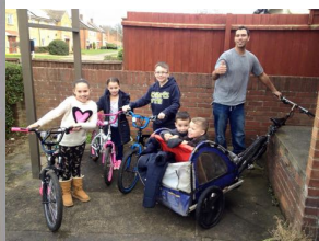
Great family that rides to church every week