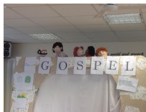
Family Fun Day