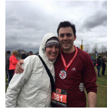
1st 1/2 Marathon