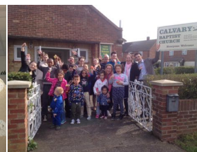
Some from the fun day