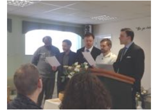
Men's Singing Special