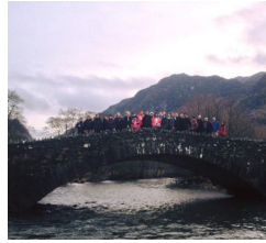
Lake District Retreat